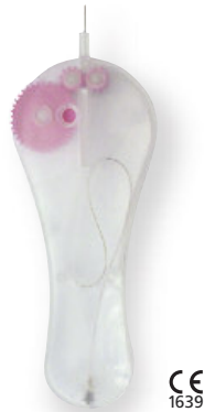
CR30i catheter with handset

The catheter is manipulated with a sterilized handset. Scrolling the handset's wheel will move the catheter in or out of the vein.